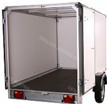
INTERIOR LIGHT Powerful and energy friendly. LED lighting. Works when trailer is attached. Fitted with switch