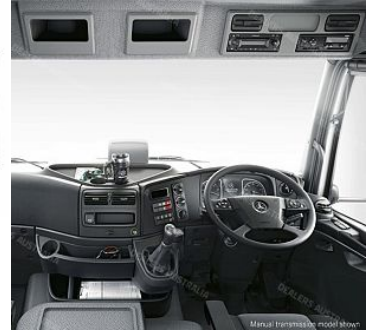
Manual transmission model shown