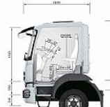
ClassicSpace S-Cab, extended