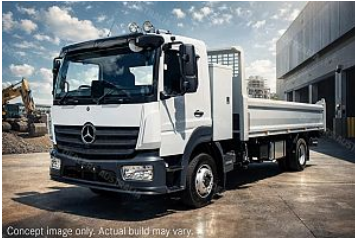
Concept image only. Actual build may vary.